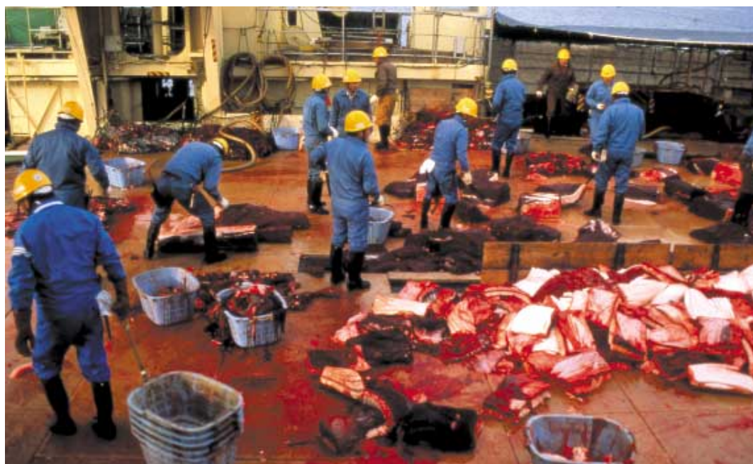
Figure 16. Whalers with large chunks of whale meat on the flensing deck.