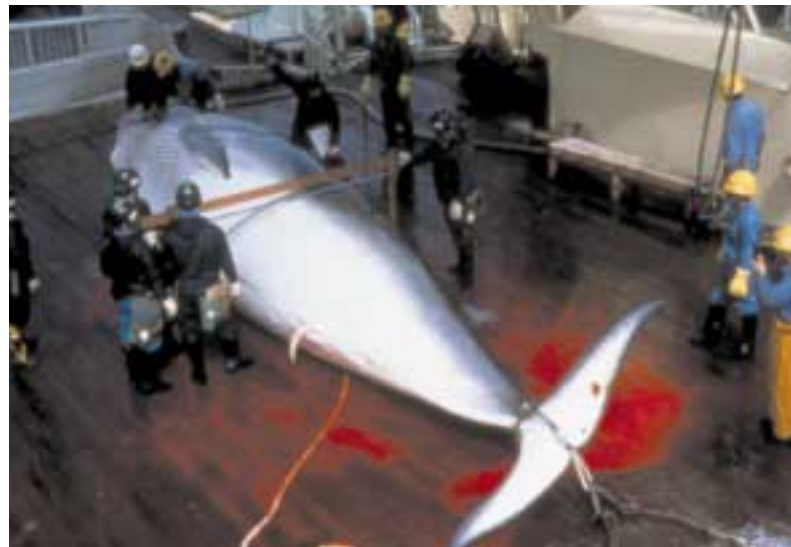
Figure 11. Minke whale being measured prior to flensing.