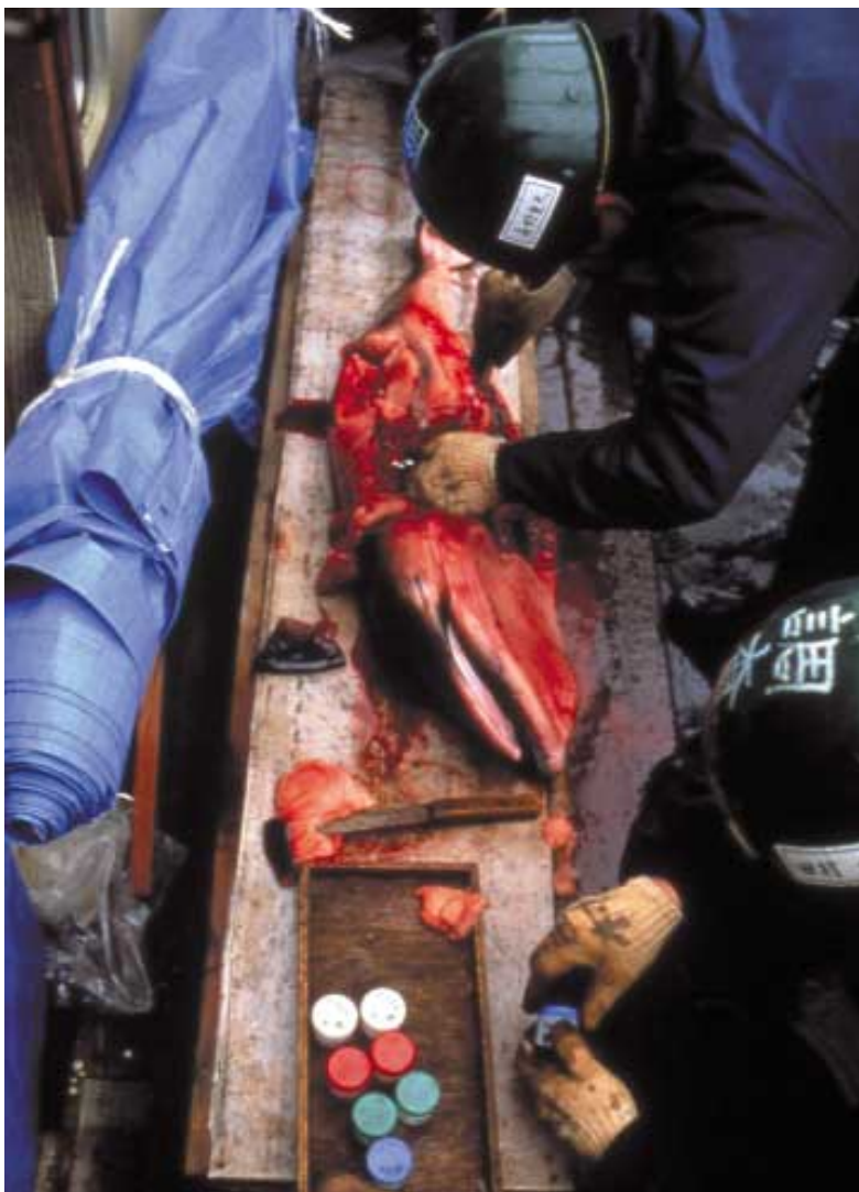
Figure 12. Measuring minke whale fetus (special permit whaling does not select out pregnant or lactating females).